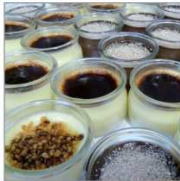
« A final touch »