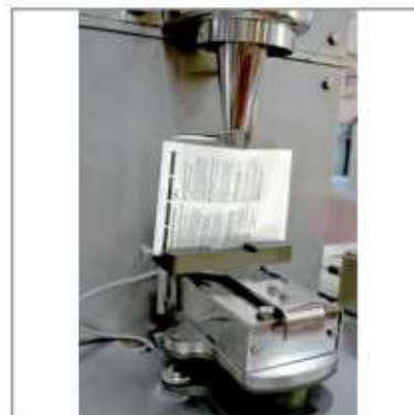
Fine filling of sachets (pharmaceutical application)