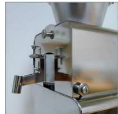
Volumetric feeder for doses from 0.05 gram to 10 grams.