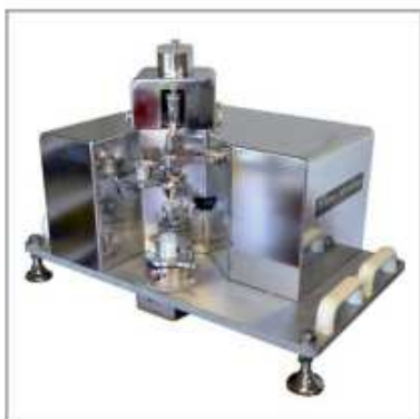
Automatic filling machine for the pharma industry