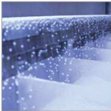
Fine distribution of granules