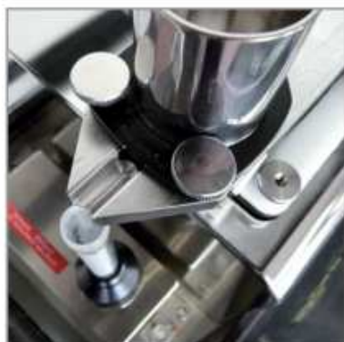
4A class gravimetric micro feeder