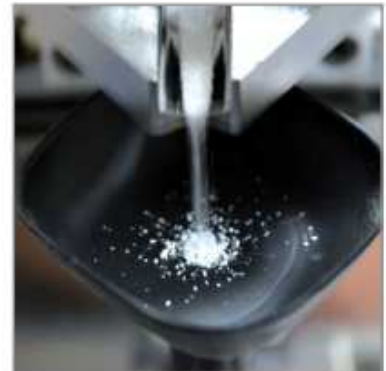
For fast & adjustable and accurate micro doses