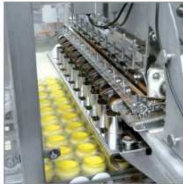
Topping of desserts