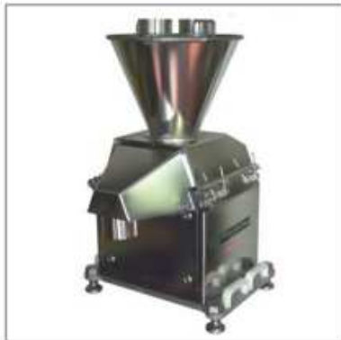
A design dedicated to the highest efficiency