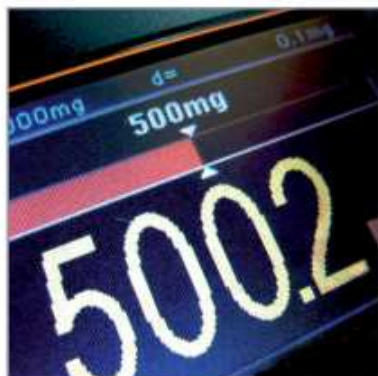
Accurate, fast and reliable