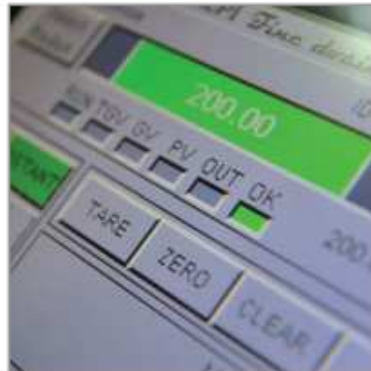
High performances behind a friendly interface