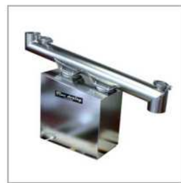
Feeding system for cosmetic powder