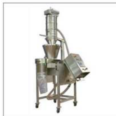
Gravimetric filling of bags for pre mix