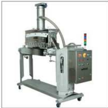
Powder scatter mounted on a "C" shape trolley.