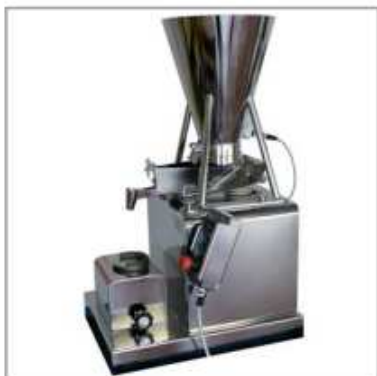
Table top feeder, accurate filling of pots