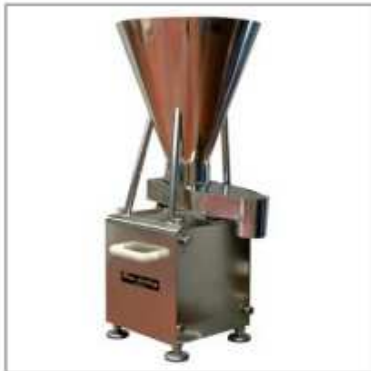
Hygienic loss in weight feeders