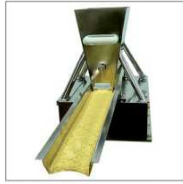
Transfer tube between 2 process equipments